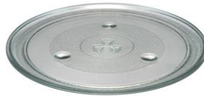
12.8" Removable Glass Turntable