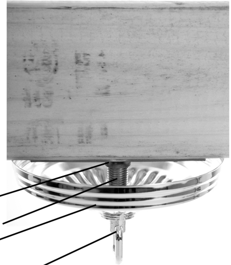
MOUNT PLATE MOUNTING BOLT COVER CAP TWIST ON HANGER

4: The lamp has excess chain to be hung at variable heights. Determine your desired height and using the 2 pairs of pliers pull the seam of the chain link apart about 1/2 of an inch. Remove the unnecessary chain but leave this gap open. Ensure the same amount of chain is removed from the second chain on the other side.