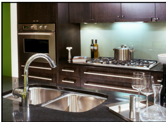
U-5050 shown undermounted in granite.