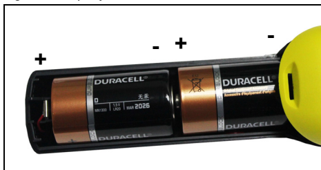
Figure 1 Properly installed alkaline batteries