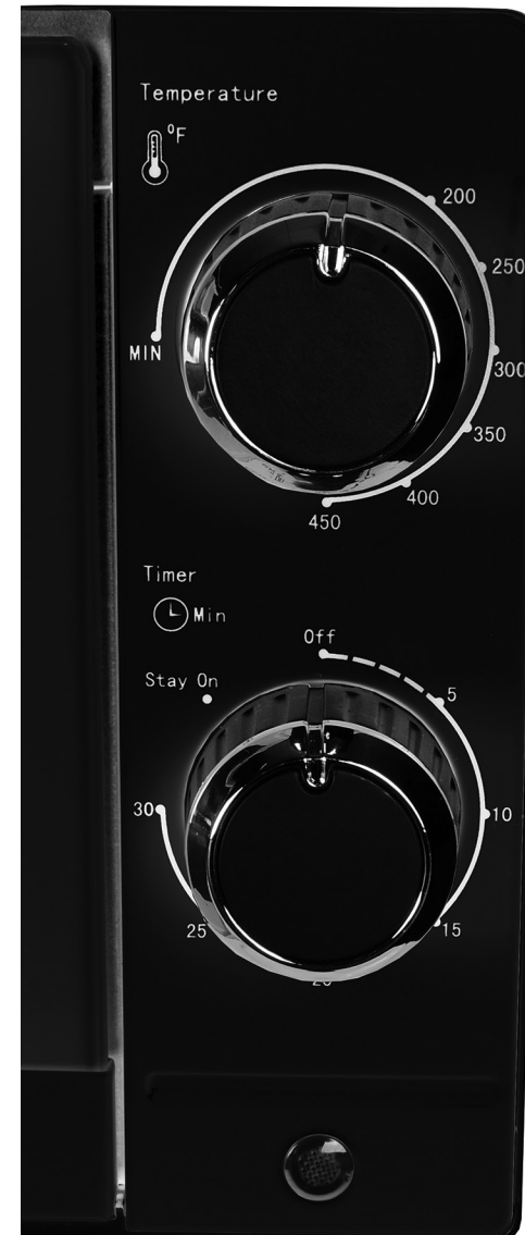
Temperature Control Knob