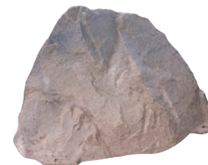
RB - Riverbed