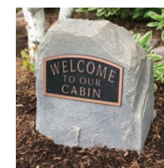
115 Rock with 653H-L-CB Address Plaque