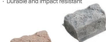
FS - Fieldstone