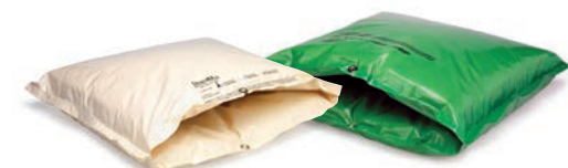
DT - Desert Tan