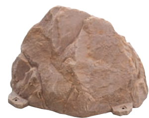
AB - Autumn Bluff

Dekorra Rock Enclosures are realistic, well-made, and available in 4 colors*