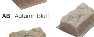
AB - Autumn Bluff