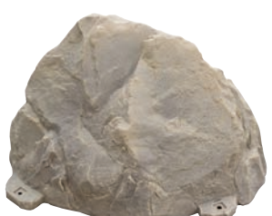
SS - Sandstone

* Each rock is unique and colors will vary.