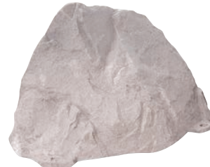
FS - Fieldstone