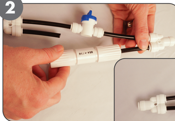
Install flow restrictor between the two short peices of blak tubing in the flush kit