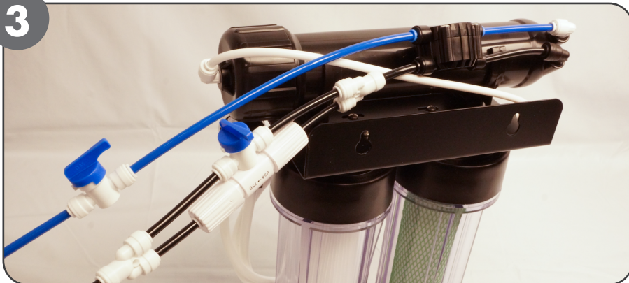
The arrow on the flow restrictor should point the same direction as flow of water.