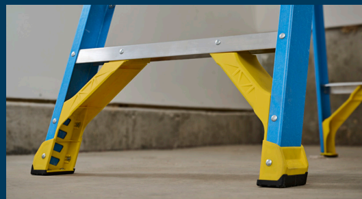
Reinforced EDGE® bracing with extra-large stability feet