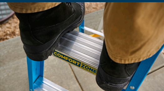
Fight foot fatigue with extra wide comfort step