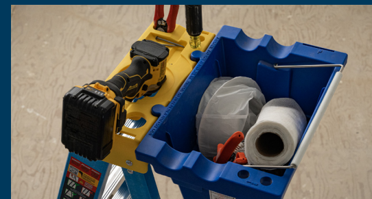
LOCKTOP™ ladder top safely holds 12 tools & is LOCK-IN™ accessory compatible