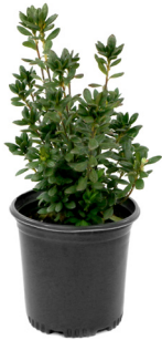
SHIPPED AS SHOWN

Your plants have been shipped to you in pots. We urge you to remove them from the shipping box and plant them as soon as possible. Should planting be delayed due to weather or other unforeseen circumstances, roll the plastic bag down around each plant and place them near a bright window or other sunny location. Keep them well-watered in their pots until permanently planted. Once planted, they begin setting roots and, as the weather warms, begin showing new growth. Please plant as soon as possible, provide reasonable care and be patient. The foliage on potted plants may appear slightly wilted or yellow upon arrival. This is due to the stress of shipping and is usually nothing to worry about. Water the plant thoroughly, place it in a shady location and remove any foliage that does not recover.