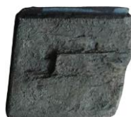
Fountain Back Door 1x