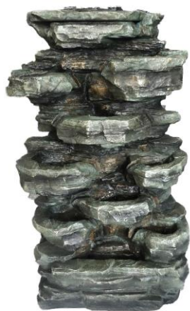
Fountain (8 LED lights pre-installed) 1x