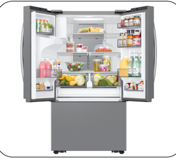
Mega 31 cu. ft. Capacity