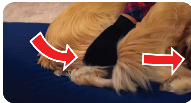
BEHIND THE LEGS AND TAIL