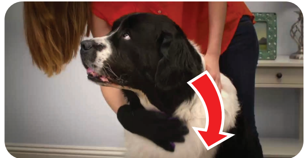
UNDER THE CHEST