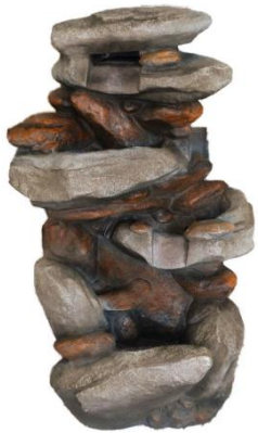
Fountain (3 LED lights pre-installed) 1x