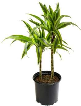
SHIPPED IN A 6-INCH POT. PLANT SIZE MAY VARY BASED ON GROWING CONDITIONS.

Note: Some leaves may appear wilted or yellow upon arrival. This is due to the stress of shipping and is nothing to worry about. Water the plant and let it recover in a shady location for a few days, then gently remove any foliage that does not recover to allow for new growth.