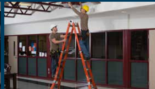
300lb load capacity per side