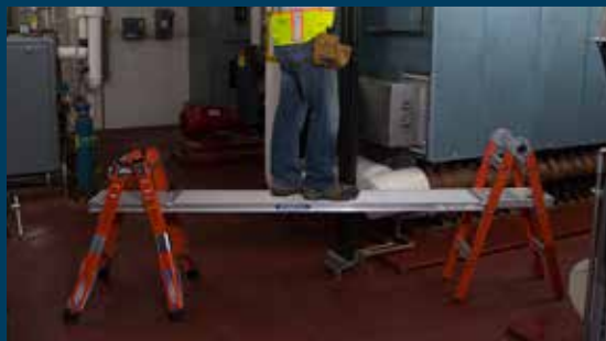
Scaffolding bases require no additional hinges* *plank and tie-downs not included