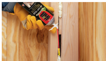
Hard to reach corners