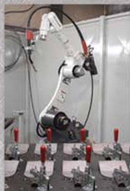
FULLY AUTOMATED ROBOTIC WELDING