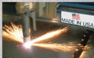
DUAL PLASMA CUTTING TABLES