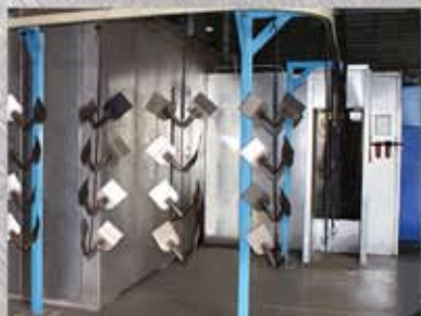
POWDER COATING SYSTEM