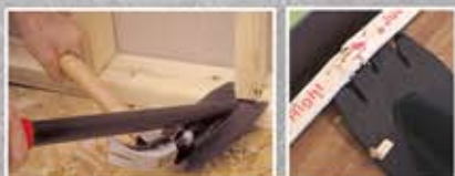
Hammer point gets you through the toughest material.