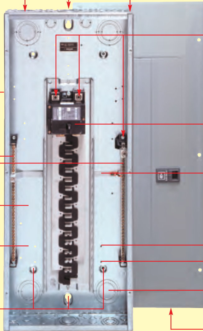
Type BR Loadcenter

Combination trim has sliding latch and adjustable deadfront for neat, clean appearance.