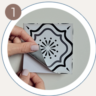
Position the Tile- Peel the Paper Behind

Before you begin ensure the surface is clean by using a damp cloth or sponge to scrub the surface. Once cleaned, wait 5 minutes until fully dry and make sure there is no residue.