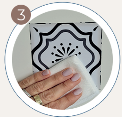
Gently go over the sticker

Position the tile in the place you'd like it. Peel the paper behind the tile sticker and apply sticker onto desired surface.