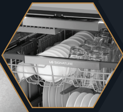
EasyRack™ Plus w/ 3rd Rack