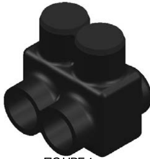
FIGURE 1 IT