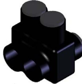
FIGURE 2 DUAL ENTRY