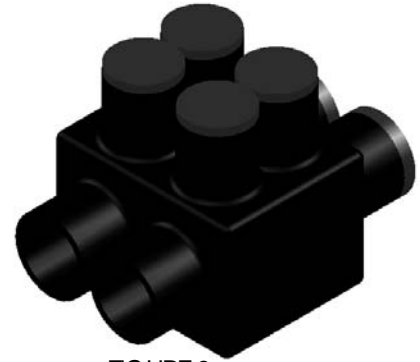
FIGURE 3 ITH