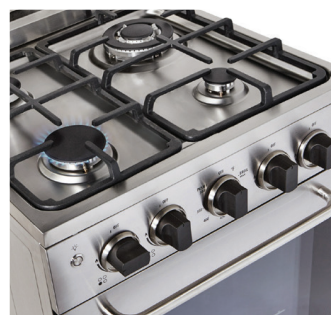
Modern knobs designed for cooktop & oven