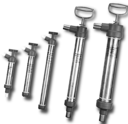
Utility Hand Pumps

To disassemble pump for cleaning and repair, pull handle out approximately 4" and place screwdriver carefully under bottom of spout cap and over outside of cylinder roll. Lift up on screwdriver and pry off spout cap. Pull out plunger shaft assembly. Lift full floating plunger off seat and clean between cup and seat. Remove intake cap in same way as spout cap. Take disc valve from cylinder and clean under neoprene flapper. Run rag through