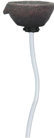
Top Basin (Pump Tubing Attached)