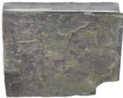
Fountain Back Door