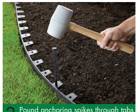
Pound anchoring spikes through tabs to secure the edging. Typical installations require one spike every