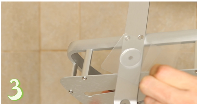
3 Take off adhesive cover