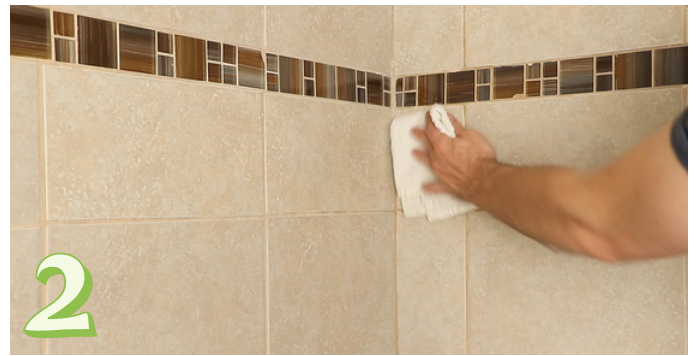
2 Clean the wall