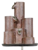
Fountain Top 1x