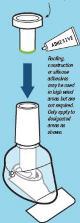
Perma-Boot® 1.5" or 2" Cap

Roofing, construction or silicone adhesives may be used in high wind areas but are not required. Only apply to designated areas as shown.