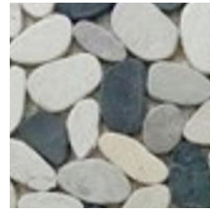
Black and Tan