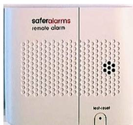
< - Test-Reset Button and LED indicator light