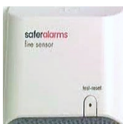
<- Test-Reset Button and LED indicator light