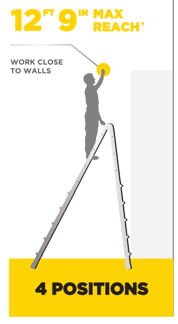
†Based on a 5<sup>FT</sup>6<sup>IN</sup> person with 12<sup>IN</sup> reach