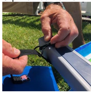
Clip the Hook to the D-ring

Open Mounted Cooler Roll Cooler into the chair Close the chair Cooler on Bike