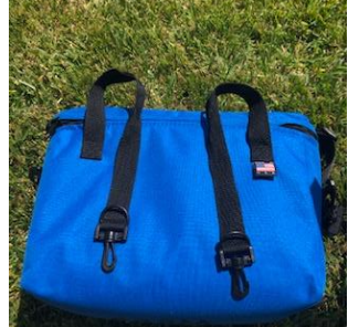
Front Mount Strap