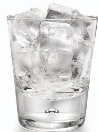
Global Product Guide

11100 East 45th Avenue • Denver, CO 80239 phone 800.423.3367 • fax 303.371.6296 www.iceomatic.com