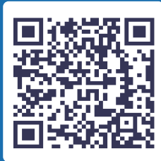
Warranty QR Code

For the best use experience. First please read the user manual carefully. Second use it and enjoy a nice day!