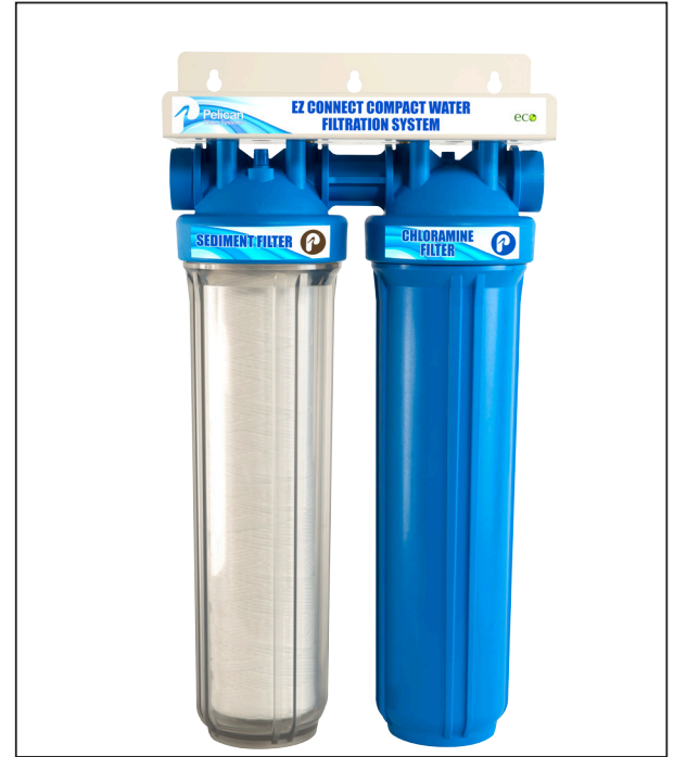
Front of Pelican EZ Connect PC-200

If this or any other system is installed in a metal (conductive) plumbing system, i.e. copper or galvanized metal, the plastic components of the system will interrupt the continuity of the plumbing system. As a result any errant electricity from improperly grounded appliances downstream or potential galvanic activity in the plumbing system can no longer ground through contiguous metal plumbing. Some homes may have been built in accordance with building codes, which actually encouraged the grounding of electrical appliances through the plumbing system. Consequently, the installation of a bypass consisting of the same material as the existing plumbing, or a grounded "jumper wire" bridging the equipment and reestablishing the contiguous conductive nature of the plumbing system must be installed prior to your systems use.