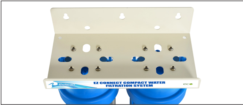
Top of Pelican EZ Connect PC-200