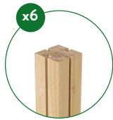
x6 12in. x 2.5in. x 2.5in. Tall Posts