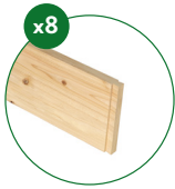
x8 4ft. x 5.5 in. Boards