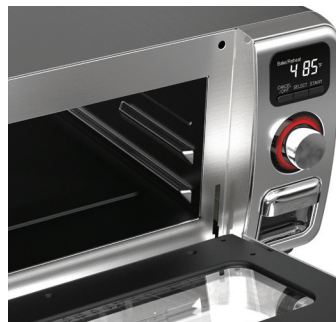
Stainless steel finish, and flat oven floor for easy cleanup. Convenient, front-loading water tank.