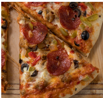
12" Personal Pizza from freezer to table. No preheating. No defrosting.

The bright and easy-to-read display keeps the control at your fingertips. Thanks to the premium stainless steel finish and hidden baking element, cleanup is fast and easy - simply wipe with a damp cloth inside and out.