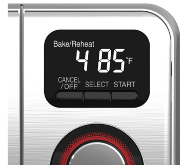
Easy-to-read display keeps you in control. Single dial control makes it easy to operate.