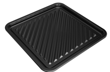
Broiling Pan (12.5" x 12.5")

*Internal capacity calculated by measuring maximum width, depth and height. Actual capacity for holding food is less.