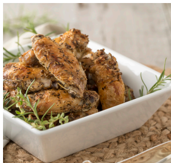
Herbed Chicken Drumsticks grilled for 30 minutes. See the included cook book for the recipe!