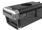
Water Tank (6.8 oz.)