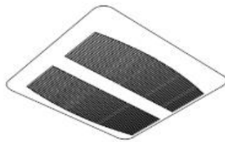
1x Grille Assembly (Includes 2x Grille Springs)