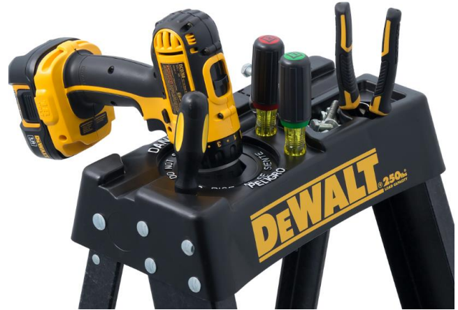
Load Capacity with Heat Transfer

All natural color on aluminum & steel Slip resistant tread call out on 3" Step