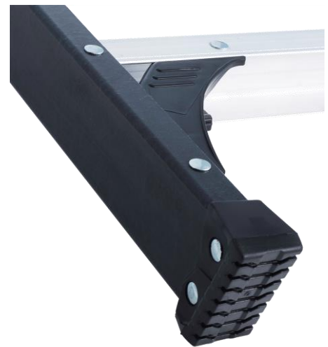
Heavy Duty Boot