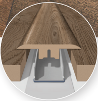
T-MOLDING Joins two hard surface floors of equal height.