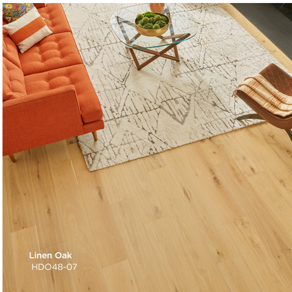
Linen Oak HDO48-07