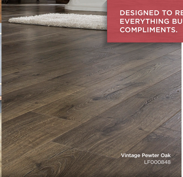
Vintage Pewter Oak LF000848

DESIGNED TO RESIST EVERYTHING BUT COMPLIMENTS.