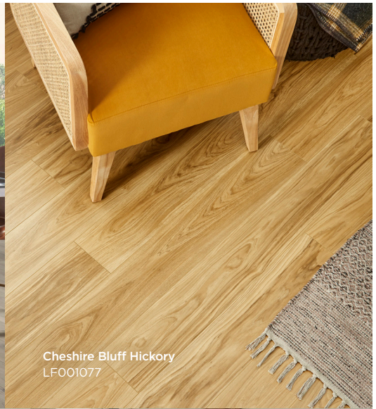
Cheshire Bluff Hickory LF001077