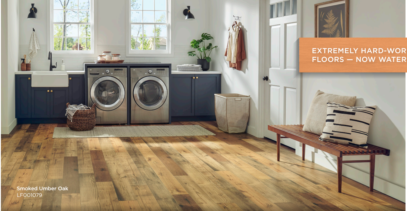
Smoked Umber Oak LF001079

EXTREMELY HARD-WORKING FLOORS — NOW WATERPROOF!