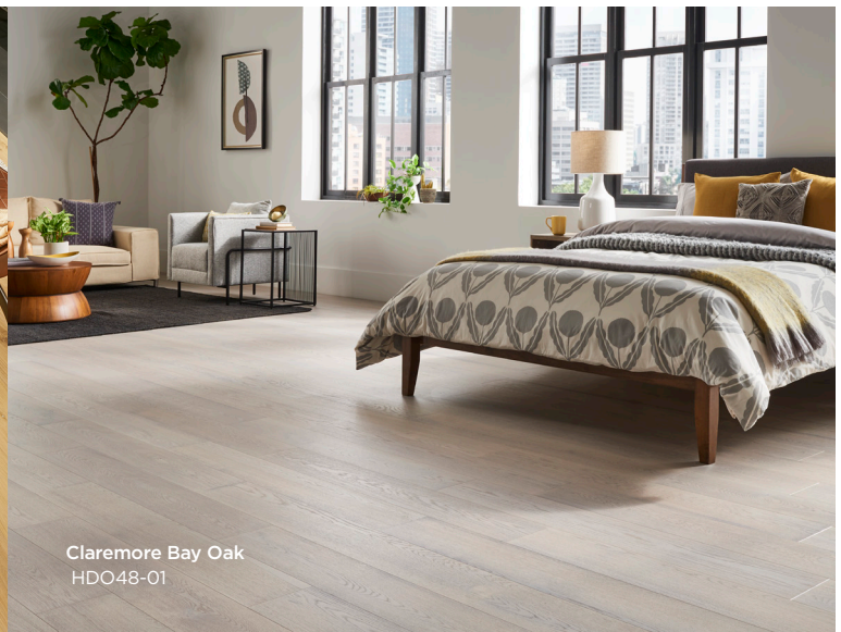
Claremore Bay Oak HDO48-01