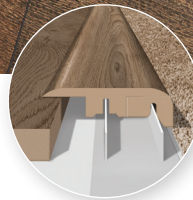
CARPET TRANSITION Finishes hard surface flooring where it meets carpet.