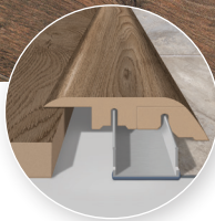
HARD SURFACE REDUCER Transitions between two hard surface floors of different heights.