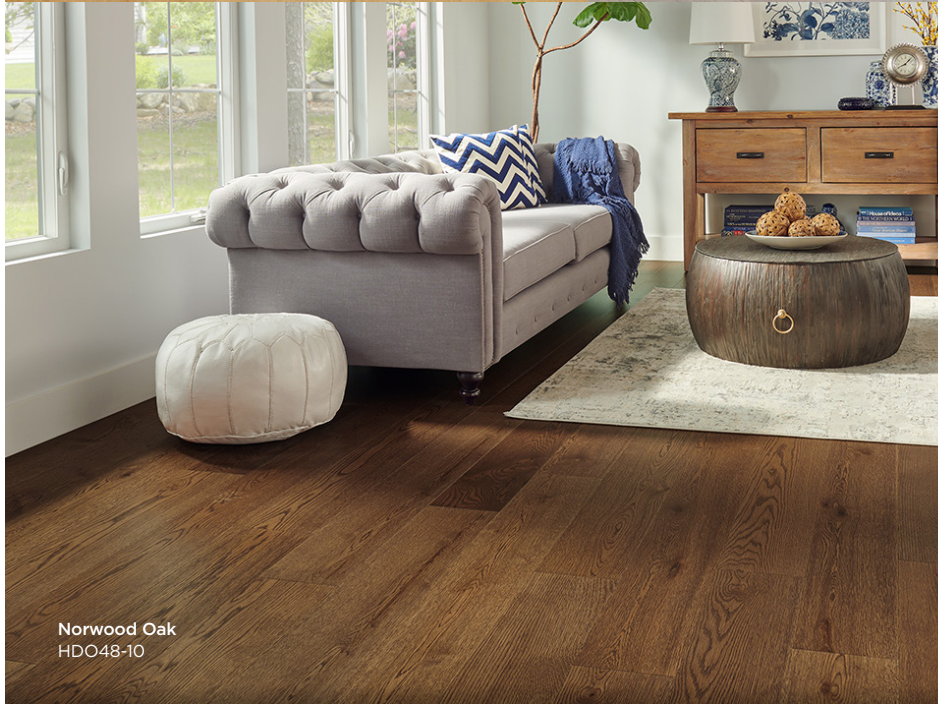
Norwood Oak HDO48-10

NATURALLY BEAUTIFUL HARDWOODS DESIGNED TO BE DURABLE.