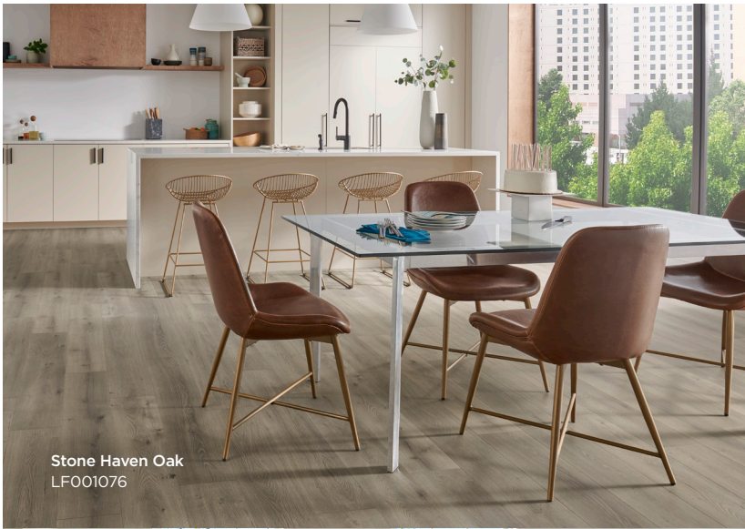
Stone Haven Oak LF001076