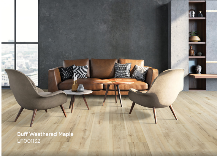
Buff Weathered Maple LF001132