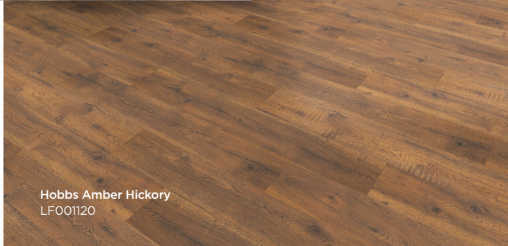
Hobbs Amber Hickory LF001120

NOW WITH A LIFETIME PET SCRATCH WARRANTY.