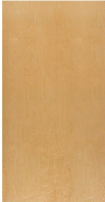
Birch Sap Rotary Whole Piece A