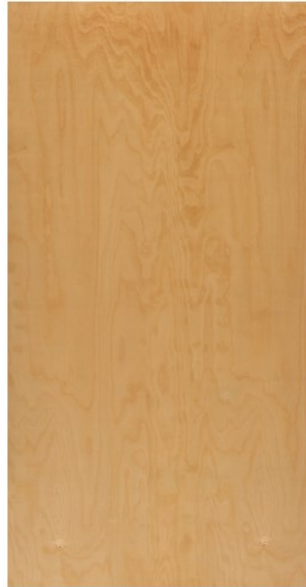
Birch Sap Rotary Whole Piece B