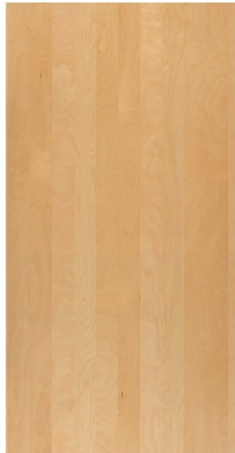
Birch Sap Rotary Back 1