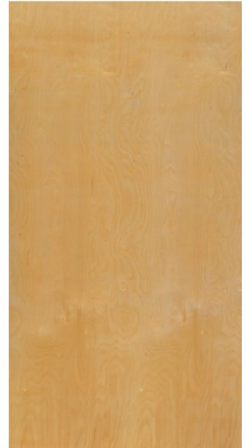
Birch Sap Rotary Whole Piece C