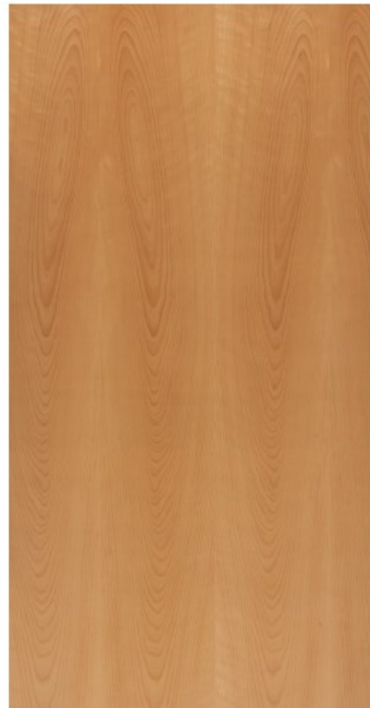
Birch Sap Plain Sliced A