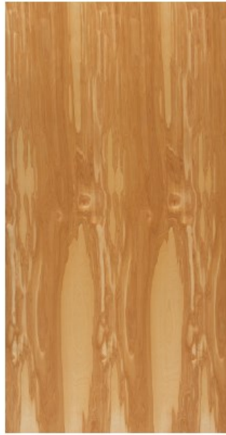
Birch Natural Rotary Whole Piece B