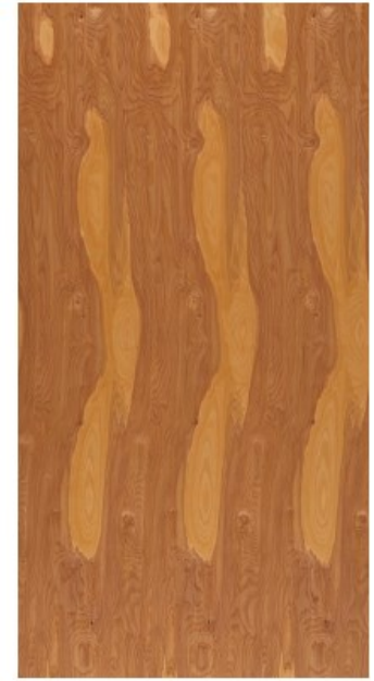
Birch Natural Rotary Whole Piece C