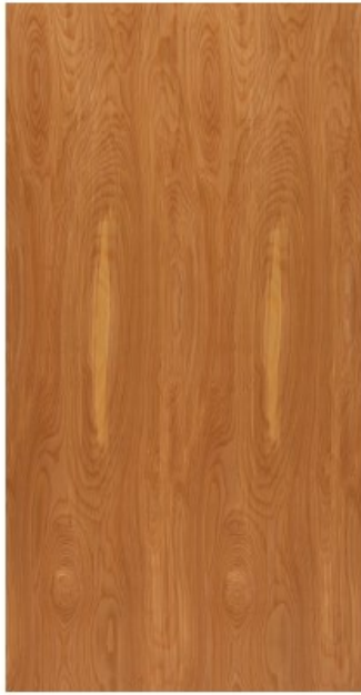
Birch Natural Rotary Whole Piece A