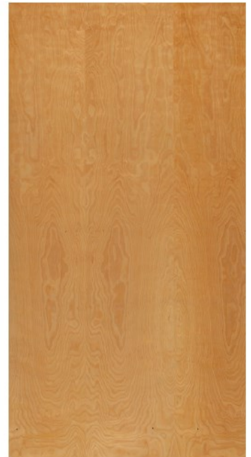
Birch Sap Rotary Spliced A