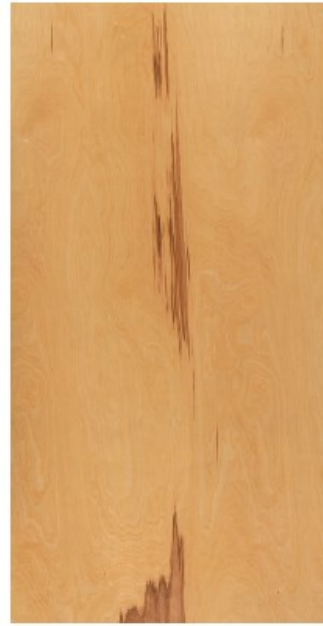
Birch Natural Rotary Whole Piece C