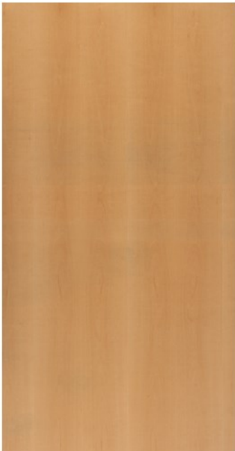
Birch Sap Plain Sliced A