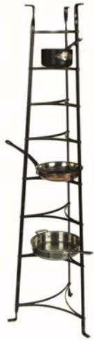
FINISHED PRODUCT IN USE

WARNING: READ ALL OF THE INSTRUCTIONS BEFORE ASSEMBLING AND USING YOUR RACK