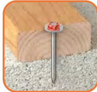
Wood to Concrete