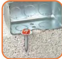
Steel to Concrete