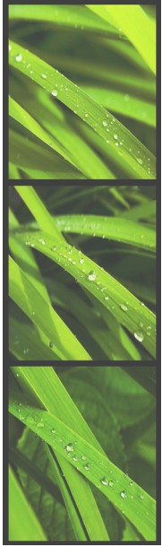
Ecology Pack by Nerghal

In Emac® we are aware about the value of moving towards a sustainable and respectful commitment with the Environment. Therefore, in our commitment with nature, quality and service, in Emac® we work with the following principles: