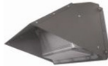
Full Cutoff Cover