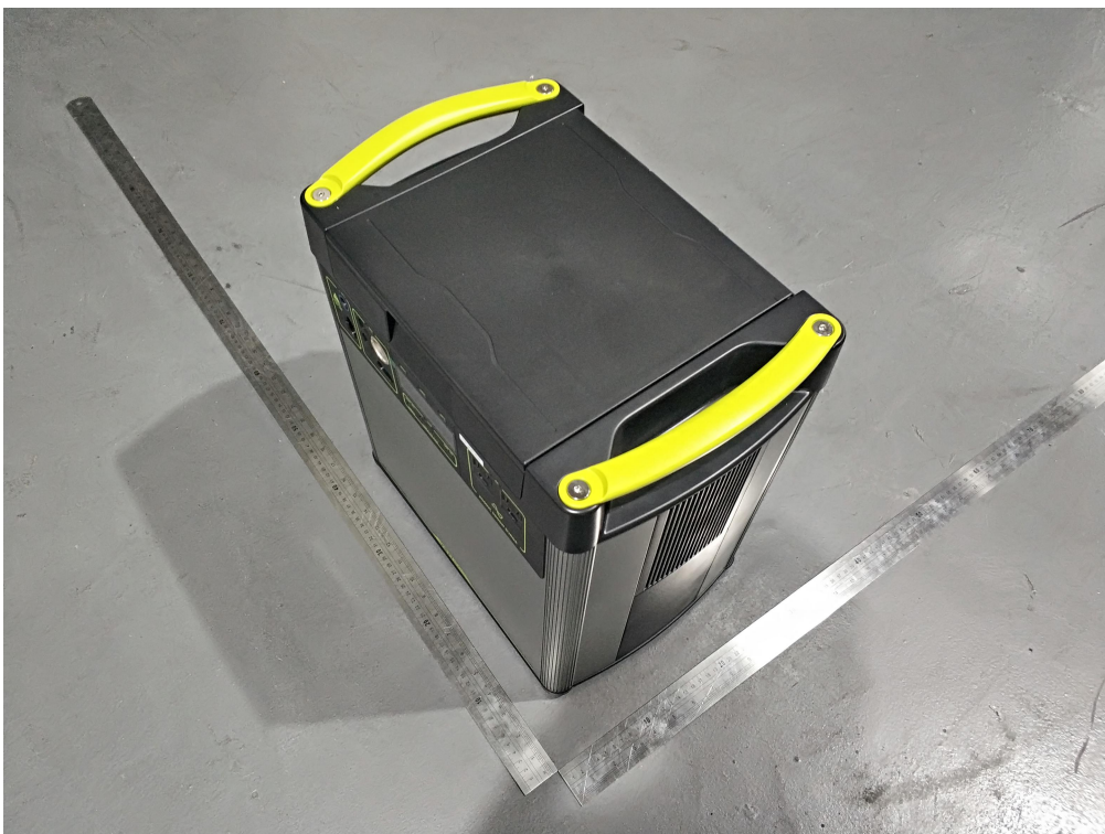
Figure 2 Overall view II of battery