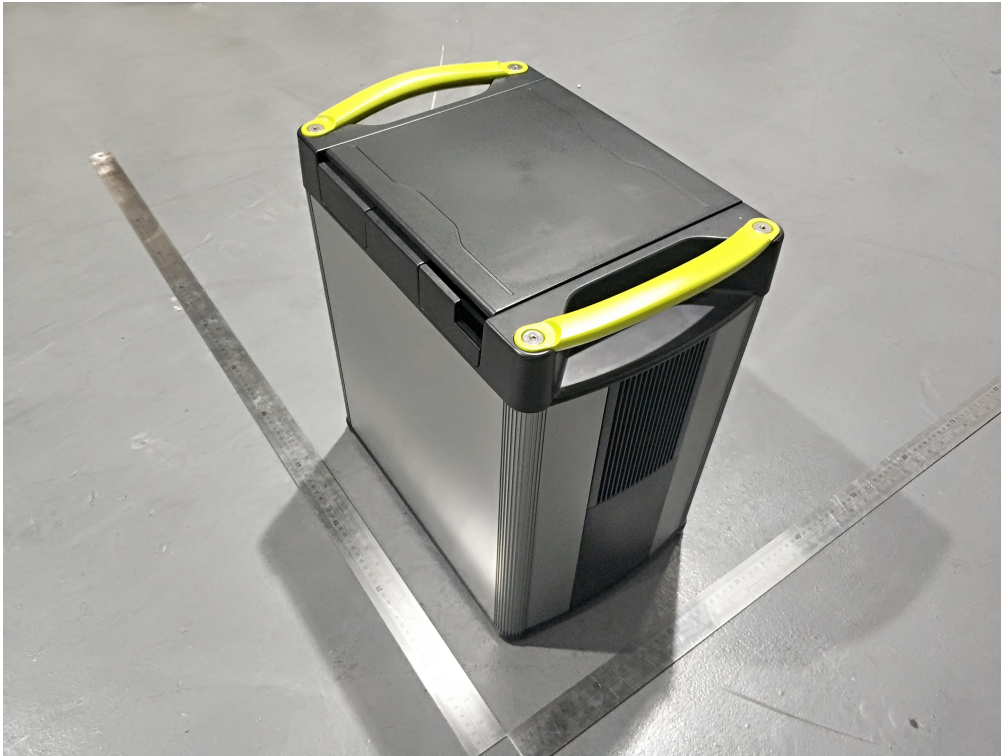
Figure 1 Overall view I of battery