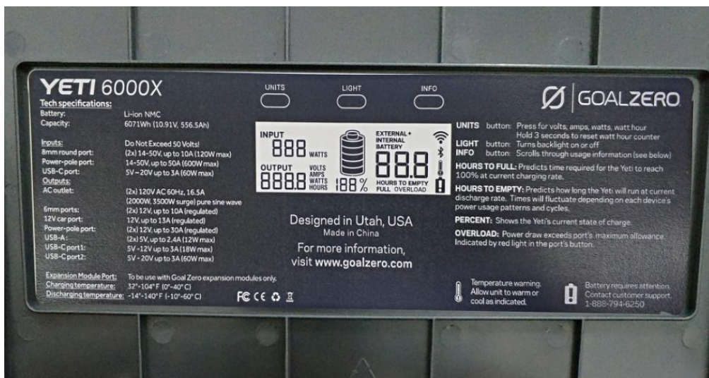
Figure 4 Battery label