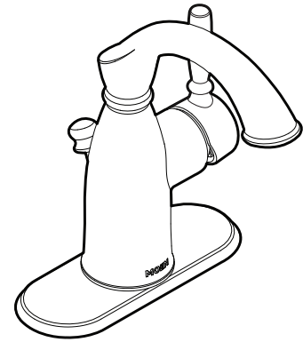
Sarona™ Single-Handle Lavatory Faucet Model: 84144 series

NOTE: THIS FAUCET IS DESIGNED TO BE INSTALLED THRU 1 HOLE, 1-1/8" MIN. DIA.