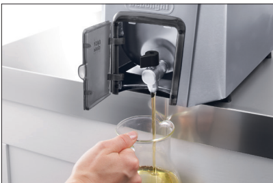
1. EASY DRAINING Leftover oil is quickly and easily removed with the EasyClean draining system.

With the Livenza Deep Fryer with EasyClean System it's easy to gather your friends and family for meals and snacks. Whether it's the enticing aroma of crispy French fries, or the mouthwatering fragrance of homemade donuts, every indulgent treat you prepare will be delicious. And, with its large capacity, be prepared for lots of company!