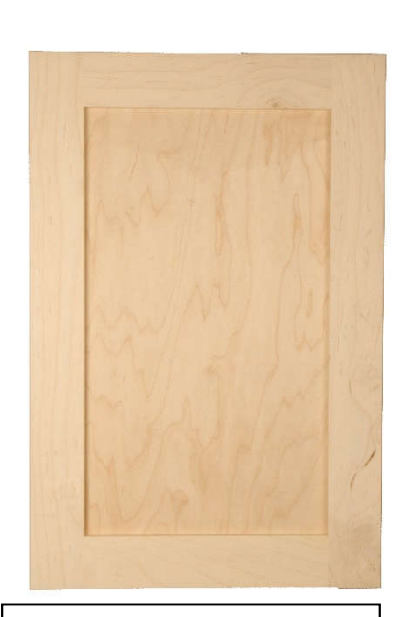
Solid Maple Shaker style door can open either direction