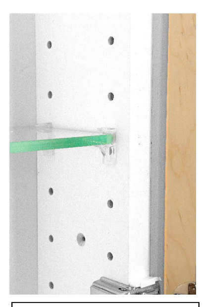
Our own design of shelf supports assures the shelves won't fall off or rock.