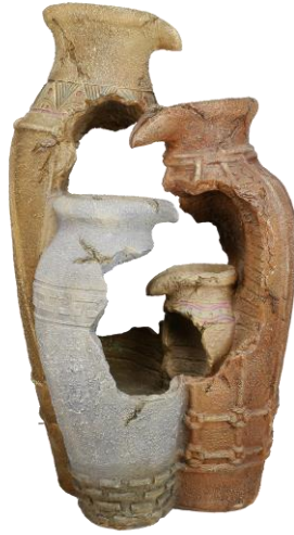
Fountain (LED lights pre-installed) 1x